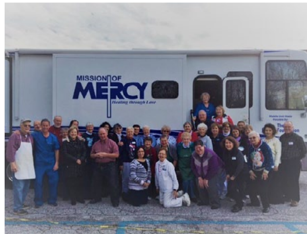
THE REISTERSTOWN TEAM