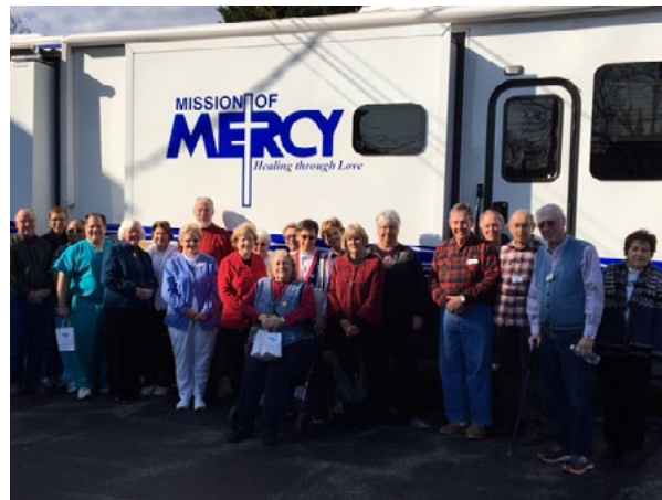
THE TANEYTOWN TEAM