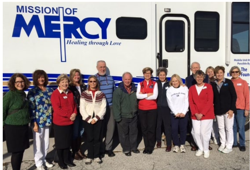
THE GETTYSBURG TEAM

Talk about power in numbers! Every time our mobile medical van pulls into one of our clinic sites to set up for the day, a large cadre of volunteers follows close behind. Within minutes, they are scurrying about like busy bees, setting up medical equipment, pulling records, setting up the registration table and screening areas, etc. The faces may be different from week to week, but the care they deliver never changes. Our patients know they will always find compassion, dignity and healing at Mission of Mercy. Our thanks once again to all these amazing and selfless people who make this happen! We will feature our other sites in our next issue.