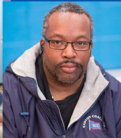
A M.O.M. Patient