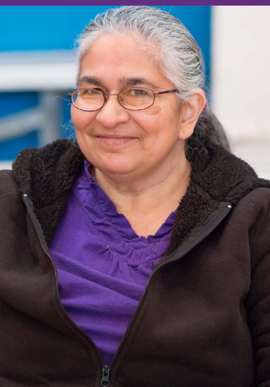
A M.O.M. Patient