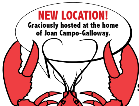
Table Sponsorships Available

Tell Your Friends - Invitations Coming Soon!