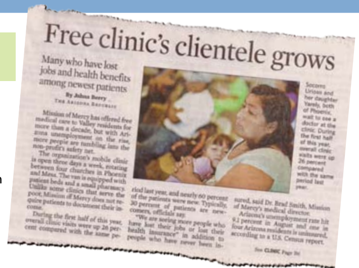
Source: The Arizona Republic, Oct. 4, 2009